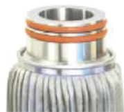
222 Open End