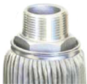
Threaded Open End