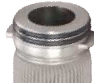
226 Open End