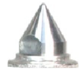
Cone Close End